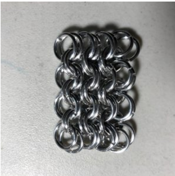
King's Maille (European 8 on 2)

Then I thought of using King's Maille, or European 8 on 2. Again, I'll leave the name up to the reader to figure out. This one is much denser, yet keeps its flexibility in both directions. And... it will join to the 4 on 1 easily. It is a bit harder to produce though, but it looks cool and it's more protection for a stabbing thrust in the heart area.