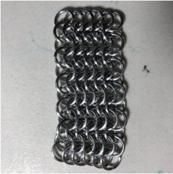
European 6 on 1

Then I thought of using King's Maille, or European 8 on 2. Again, I'll leave the name up to the reader to figure out. This one is much denser, yet keeps its flexibility in both directions. And... it will join to the 4 on 1 easily. It is a bit harder to produce though, but it looks cool and it's more protection for a stabbing thrust in the heart area.